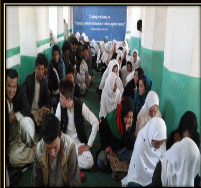
Youth trainees participated at youth engagement in elimination of violence against women training in Shahrstan District, Daikundi province on June- 1 st -2015.