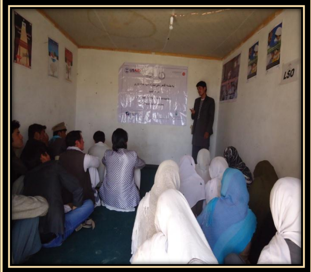
Anti-Corruption Session for Youth in Daikundi Province on Nov, 20 th , 2015