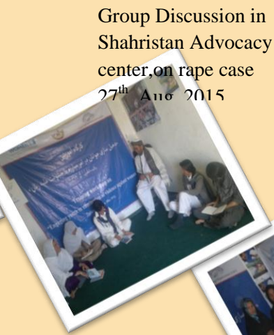
Advocacy Focused Group Discussion in Shahrستان Advocacy center, on rape case 27 th Aug 2015