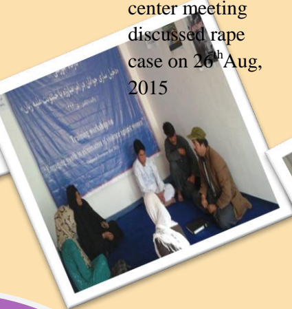
Nili advocacy center meeting discussed rape case on 26 th Aug, 2015