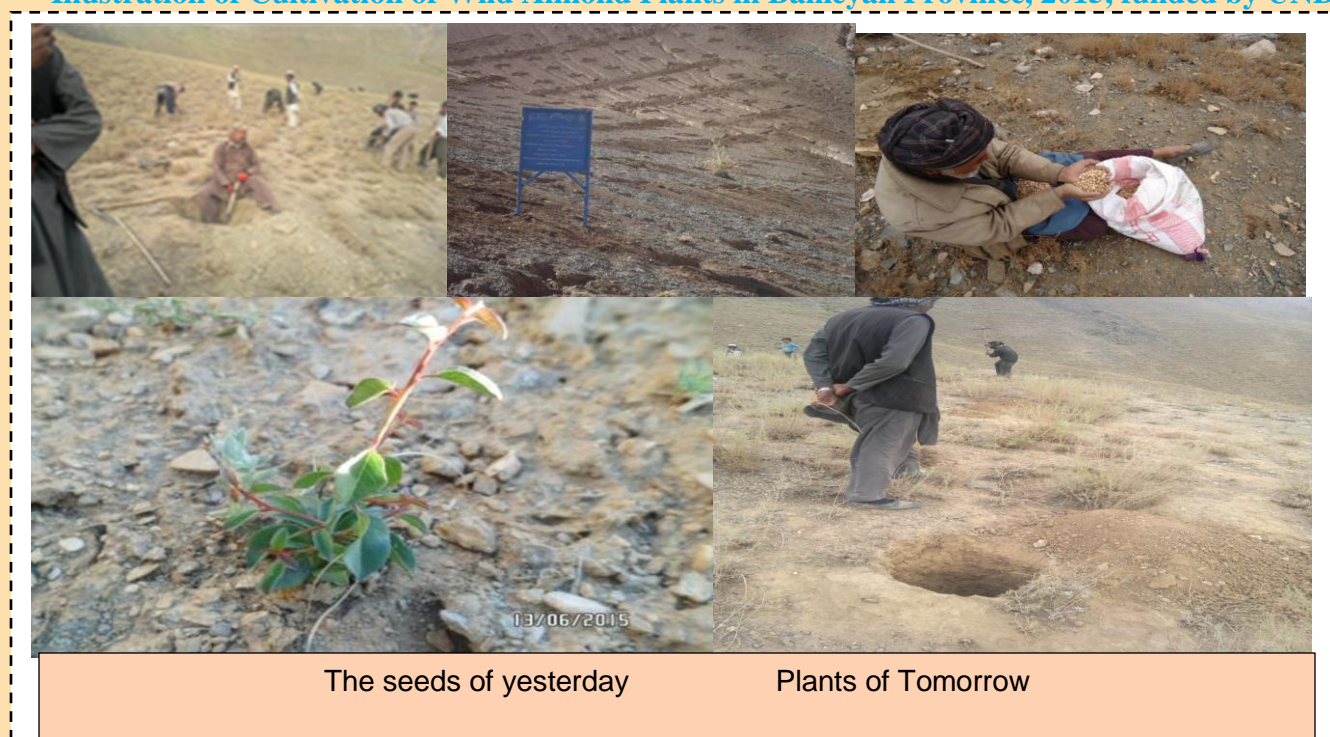
Illustration of Cultivation of Wild Almond Plants in Bameyan Province, 2015, funded by UNDP

-May, 5 th , 2014- Dec, 31 st , 2015, LSO cultivated 10 hectares of land with wild almond and cherry seeds in 30 villages (500 households with population 3000 people- 1700 female and 1300 male) in mentioned district. This project was granted by UNDP with the aim of reforestation of the mountainous areas and protecting people from avalanche and soil erosion for the period of May, 5 th , 2014– 5 June 2016. The last monitoring from project area on 11 th Dec, 2015 show, all wild almond and cherry were grown and protected well. People are hopeful that plants will grow further to make area greener and increase their natural resources.