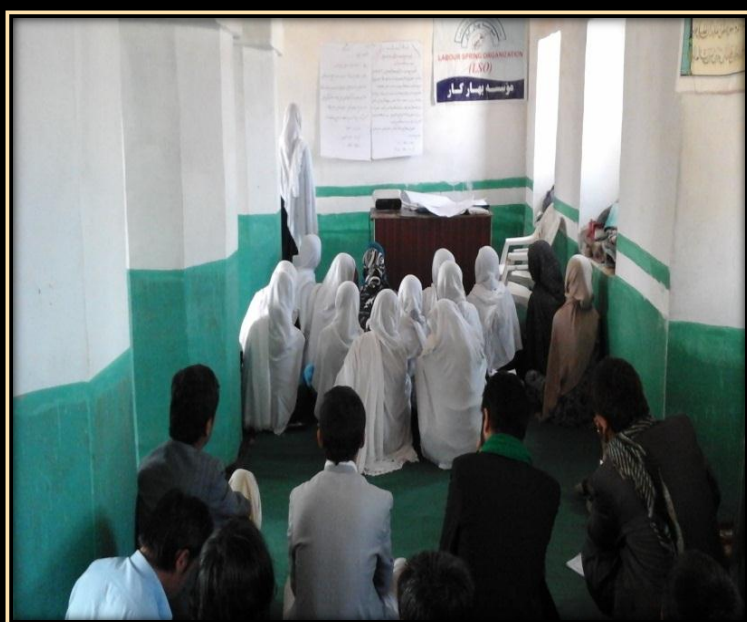
Youth trainees participated at youth engagement training in elimination of violence against women in Nili District, Daikundi province on 28 th , June, 2015.