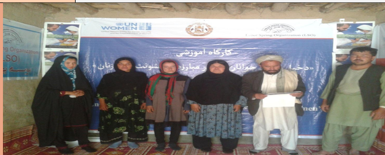
Advocacy members committee campaign on ending violence against women in Ashterly District of Daikndi Province in 2015