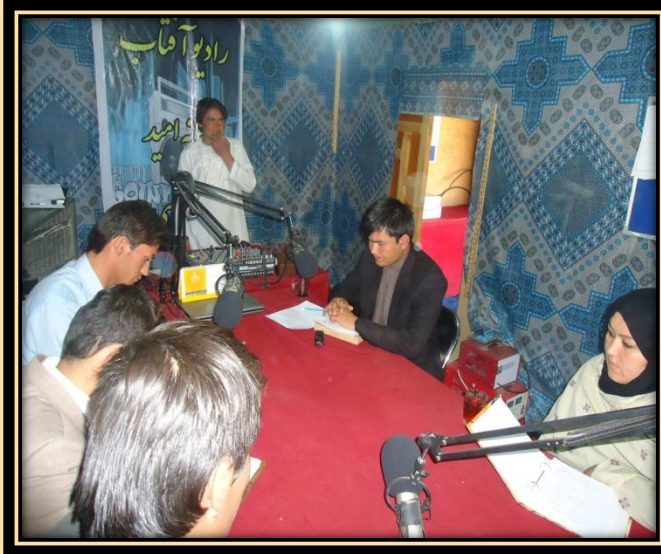
Radio Round Table on Anti-Corruption at Radio Aftab on Dec, 2015