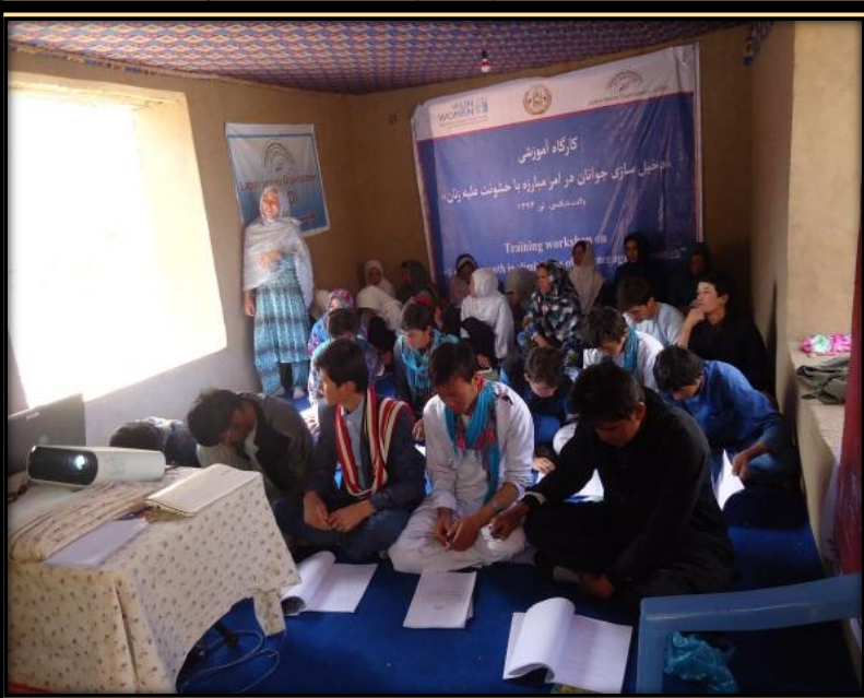
Youth trainees participated at youth engagement in elimination of violence against women training in Ashterlai district, Daikundi province on June-23 rd -2015.