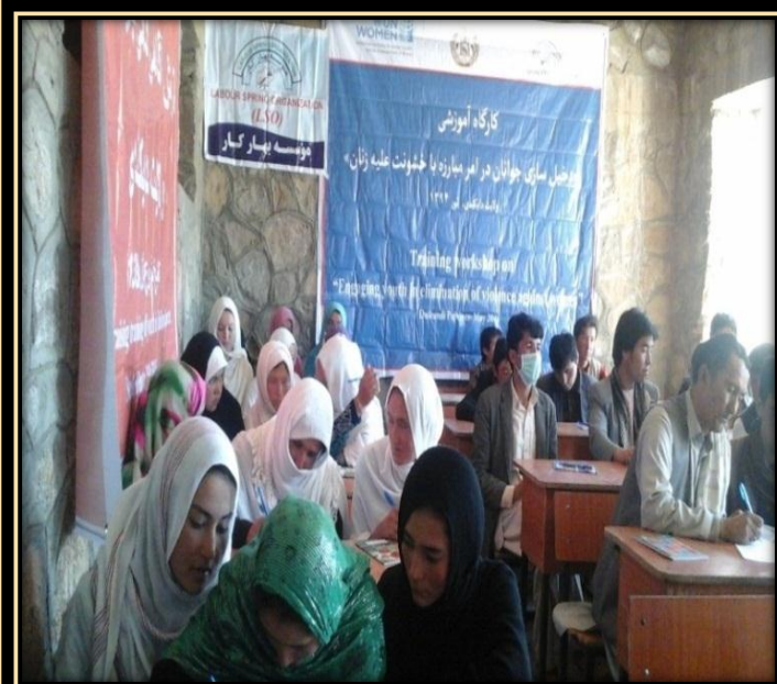
Youth trainees participated at training of youth engagement in elimination of violence against women in Khidir District, Daikundi province on June 5 th , 2015.