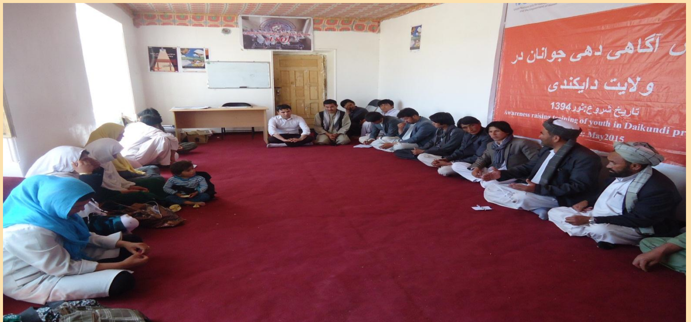
Advocacy Committee Members Gathered Together in Nili district, Daikundi Province to Coordinate Their Advocacy Activities 2015.

LSO implemented youth engagement in elimination of violence against women project (EVAW/G) in Shahrstan, Gizab, Khider, Ashterlai and Nili Districts of Daikundi Province from Feb 1st – Dec, 31st, 2015. This project was aimed to ensure women basic rights, advocacy of VAW survivors by raising awareness of youth on women rights, EVAW Law, Advocacy Method and Youth Civil Rights. For this program, 576 youth ( 243 male and 333 female) were selected as trainees from 15 schools, Nasir Khusraw Private University, Legan Institute of Midwifery and 5 mosques belonging to target districts [below photos- explanation and images about trainees].